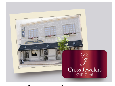
Gift certificate to Cross Jewelers in Portland for $250.