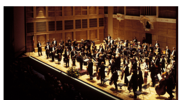
Fall music package. Tickets for two to: FOKO's Orgelfest in August, the Portland Symphony Orchestra (2 dates), and PCM's Early Music Festival in October.